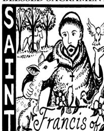
Blessing of animals